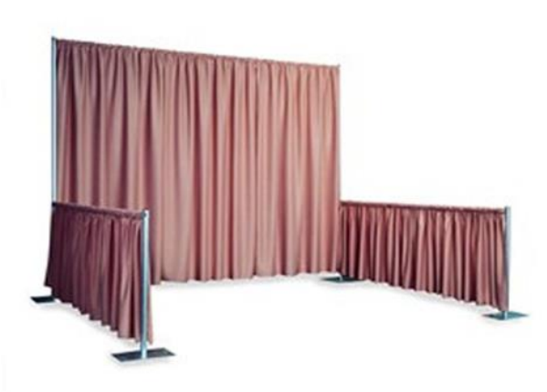
(10' x 8' example image)

Please review the sponsorship opportunities as many levels include exhibit options in addition to the sponsored items